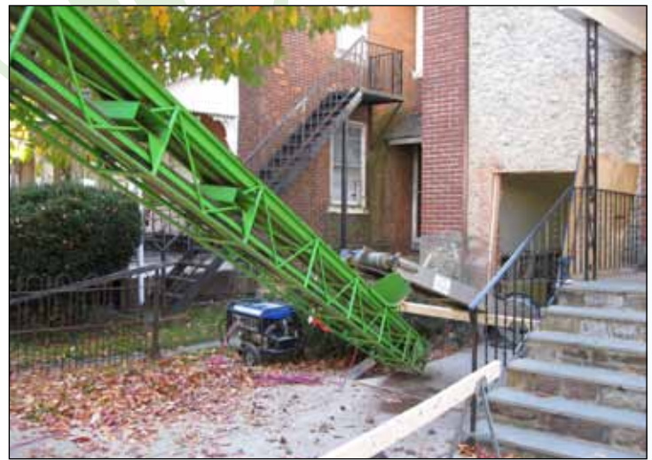
Montco Bible Fellowship - Lansdale Elevator retrofit